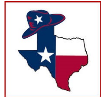
Red Texas Forum - Dallas